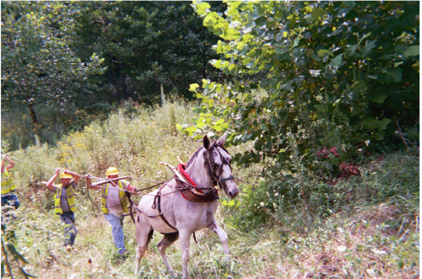
Employees of Foothills Rural Telephone Cooperative use a horse to lay fiber in rural Johnson County, Ky.

and then loaded them with donated software from Microsoft Corp. and CA Inc. Approximately 2,000 Internet-ready computers have been delivered to disadvantaged children across the state.